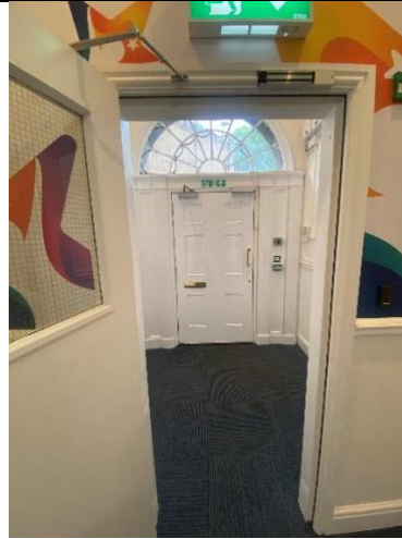
Internal ground floor entry point